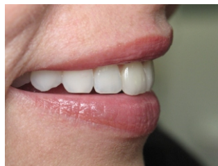
Photograph # 4: The same "Relaxed Smile Pose", as in photo #3, but taken from the side at a 75° angle to the sagittal plane. Check the labial contour and inclination, as well as incisal edge position; ideally, the incisal edges will just touch the wet-dry inner vermillion border of the lower lip.