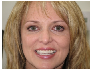
Photograph #1: Shows the patients full face while saying "eeeeee...". Notice the lips are in a full "Say Cheese" type smile. The teeth are slightly apart making the lower incisal edges clearly visible. All of the features of the face are visible in order to align the vertical mid-line and the horizontal occlusal plane.

A: The sample photographs shown below will convey all essential anatomical aspects of the desired finished restorations, such as incisal length, tooth form, incisal edge position (over-jet and over-bite), occlusal plane (Curve of Spee and Curve of Wilson), labial inclination of anteriors, the buccal corridor (buccal bulk of posteriors), gingival height of contour, and incisal and gingival embrasure contours. To insure an accurate photographic record of the patient's anatomy, each of the five photos shown below must be taken without lip retraction or anesthesia.