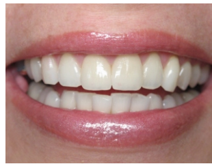
Photograph #2: A close-up of the same facial pose as photograph #1, showing no more and no less than the corners of the lips. This photo, along with the study models, helps determine whether changes to existing anatomical features are needed such as mid-line, incisal length, curve of spee, the gingival and incisal embrasure contours and the buccal corridor.