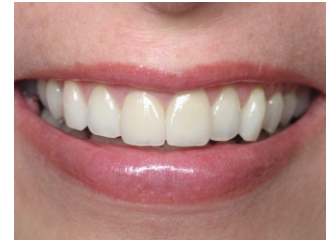
Photograph #3: The "Relaxed Smile Pose". Ideally the upper lip aligns with the gingival height of the upper anterior teeth. Also, the curve of the lower lip aligns with the upper anterior incisal edges and the buccal cusp tips of the posteriors.